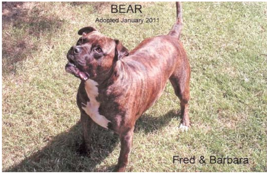
BEAR Adopted January 2011